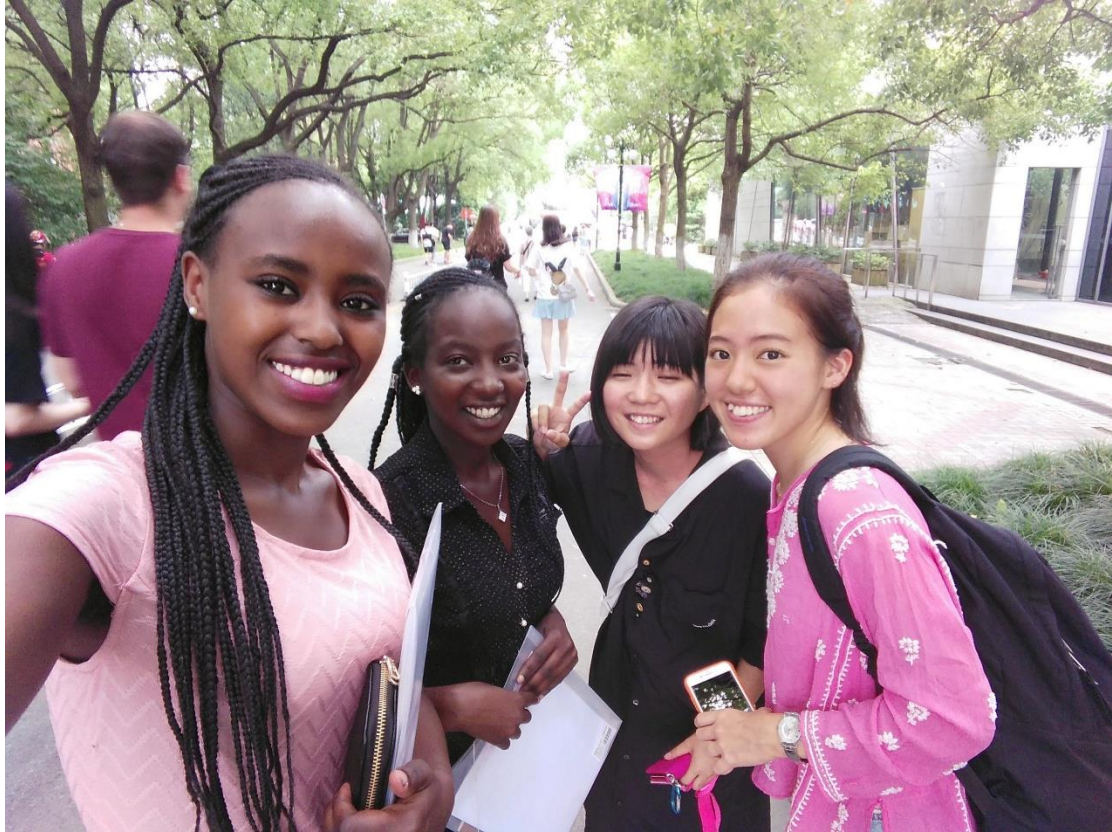
Students with their Chinese friends

Chinese people, she really hoped she could study harder and got 2019 scholarship to go back China.