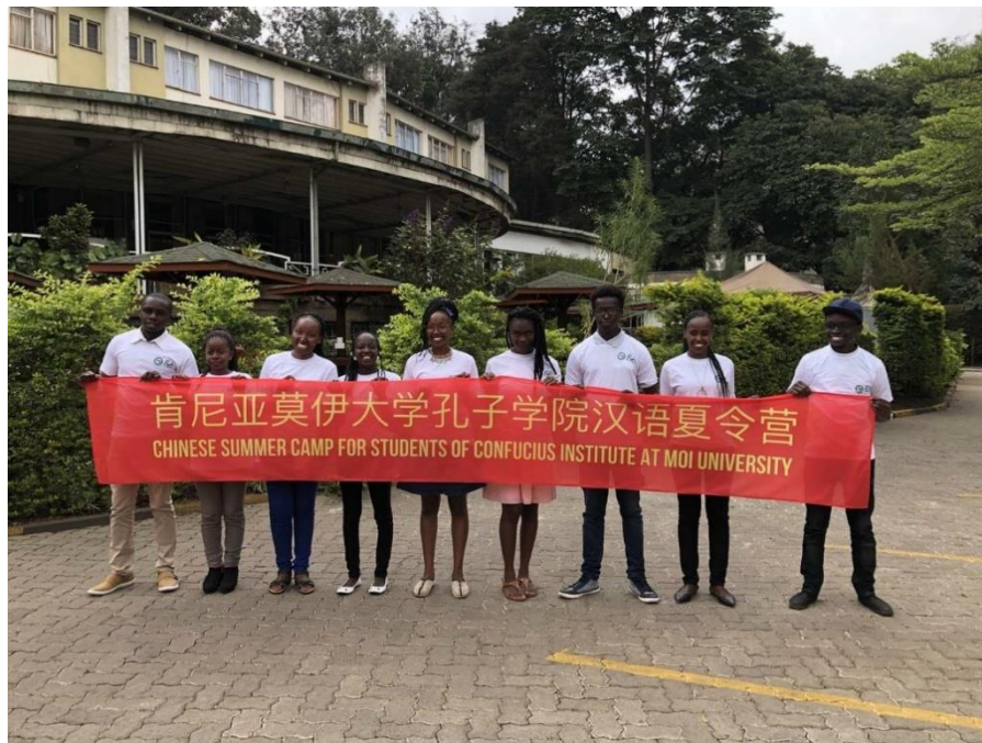
CIMU summer camp 9 students