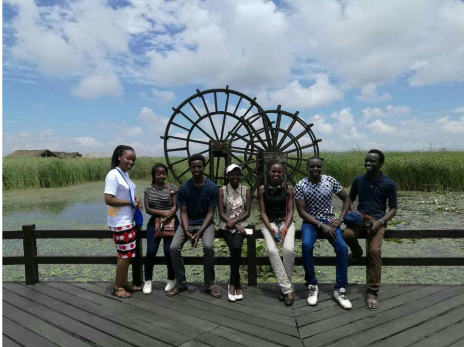
Students in Ningbo