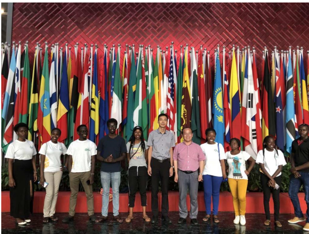
CIMU students in Confucius Institute Headquarter/Hanban

The students also went to the Forbidden City and Confucius Temple, which gave them a