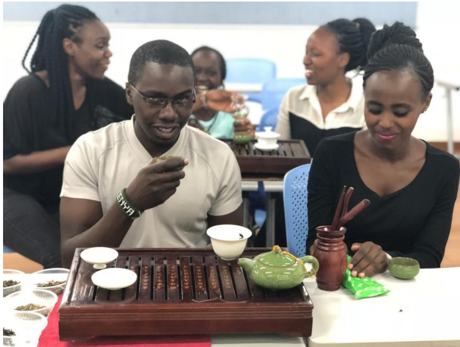
Students on the Tea class