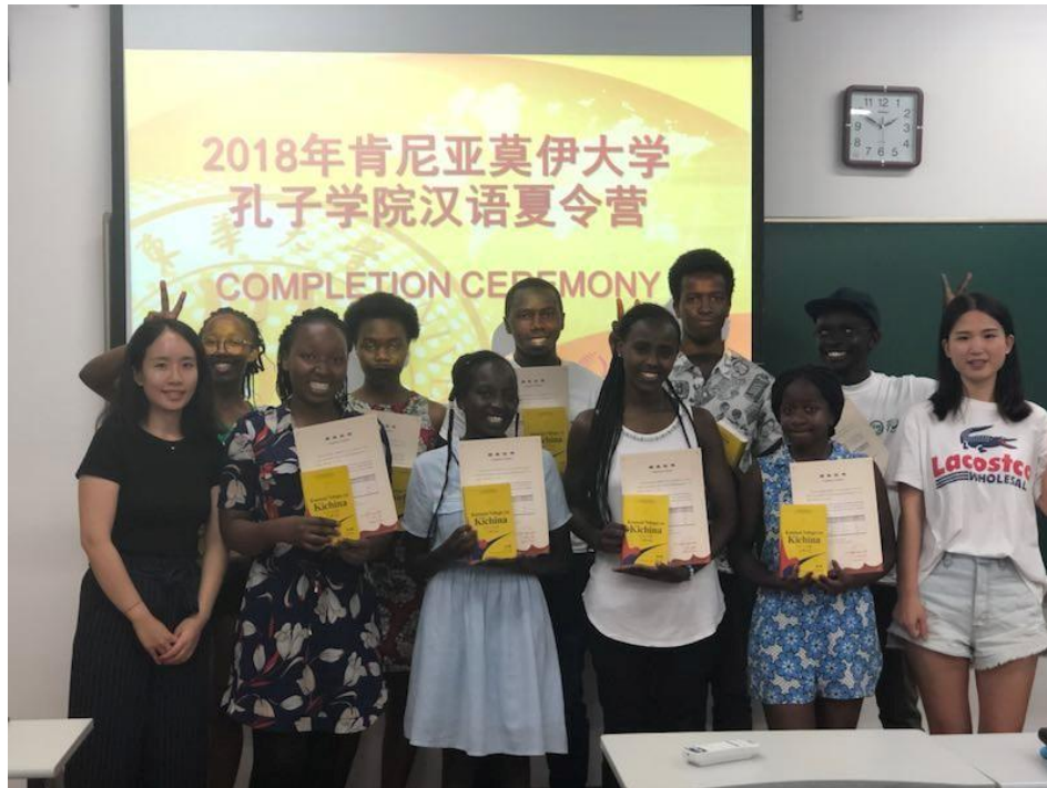
Summer camp completion ceremony